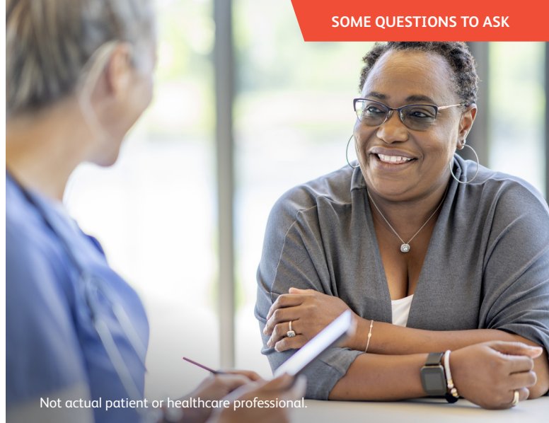
Not actual patient or healthcare professional.

These are not all of the possible side effects with ABRILADA. Tell your HCP if you have any side effect that bothers you or that does not go away. Ask your HCP or pharmacist for more information.